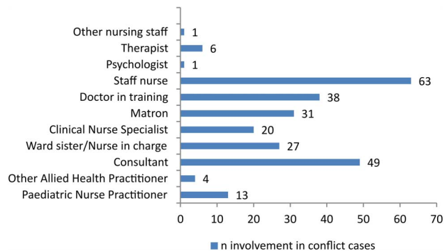
Figure 1 Staff involvement in conflicts experienced.

difficulties 18 and religious beliefs. 19 Other studies have suggested that conflict may arise when relatives are not fully supported to understand treatment and care decisions. 20 Underpinning each of these causes can be different understandings of the clinical situation 21 and different interpretations of futility 22 and likely prognosis. 11