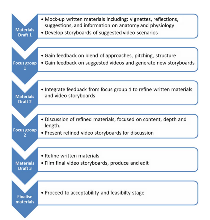
Figure 1 Intervention development process.

PrECEPt will consist of two units which are identified as priorities in the palliative literature on caregiver needs: pain\ management^{35-39} and nutrition/hydration\ needs including dietary advice, feeding techniques, hydration. The topics covered in the units and information