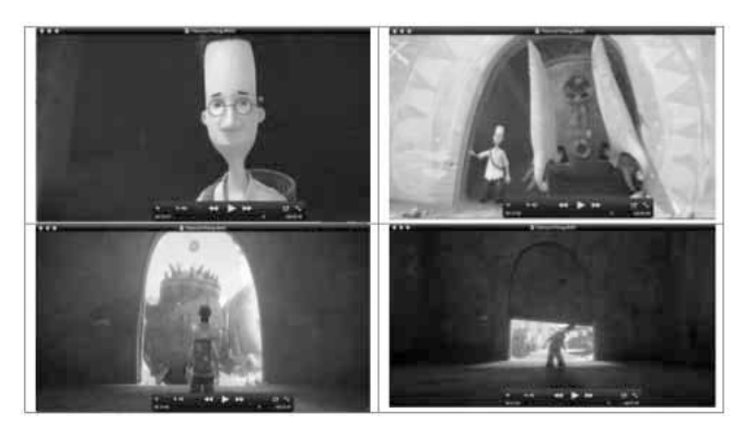
Figure 6. Saying goodbye silently in the movie of The Lost Thing

The parting of the boy and the lost thing is depicted minimally in the book through the one observe image of the boy and the lost thing in profile facing each other and waving goodbye. What is described above indicates the greater visual commitment to the depiction in the movie of the actions that occurred immediately prior to this 'waving goodbye' scene. There is also greater commitment in the movie to the actions that occurred immediately following this common 'waving' scene. This is where we see in the movie the full rear view of the boy parallel to the frontal plane of the viewer with the boy facing the door of the sanctuary as the lost thing departs through it (Figure 6 bottom left). The camera lingers on this rear view of the boy for some seconds, and as the sanctuary door closes, the boy's head is tilted to one side so that he can maintain his view through the remaining opening (Figure 6 bottom right). Collectively these images strongly imply a very significant affective bond of companionship between the boy and the lost thing. While the parting of the boy and the lost thing is ostensibly similar in the book and movie versions of the story, the difference in the visual and verbal commitment to affect privilege very different interpretive possibilities in the experience of