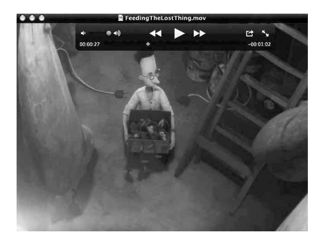
Figure 3. Focalization as the lost thing

Painter and her colleagues (2013) refer to as a contact image. Since the depicted characters gaze is directly toward the viewer, it is as if a pseudo interpersonal contact is being made. The next shift is to an eye level profile view of the boy atop the ladder feeding the lost thing from his box (Figure 4) – quite similar to the corresponding image in the book, although in the movie the social distance of the image is a little closer, and the warm yellow light seems to emanate from inside the lost thing, whereas in the book the light is much dimmer and emanates from a single bulb being held aloft by one of the tentacles inside the top of the lost thing (Figure 1).