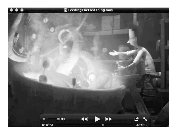
Figure 4. Feeding the lost thing - movie

distance, inclusion of contact images, and particularly the mediated point of view 'along with' and 'as' the depicted characters, shifts the reader/viewer engagement from appreciative to empathetic.