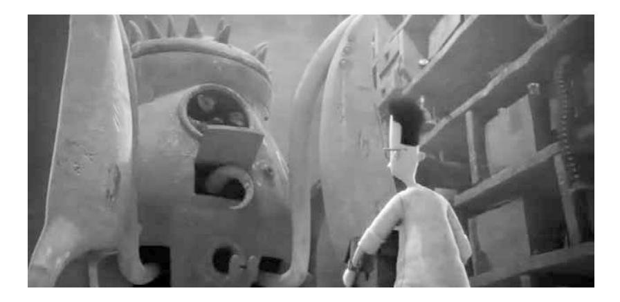
Figure 2. Gesturing to follow

(2001/2006) when the horizontal angle is such that the frontal plane of the represented participants is parallel to the frontal plane of the viewer, this indicates maximum involvement of the viewer in the world of the represented participants. An oblique horizontal angle, however, constructs the relationship between the viewer and the represented participants as "other". Notwithstanding the first person narration of the verbal text then, this image positions the viewer as a detached outside, even remote, observer, constructing a reader/ viewer stance referred to as appreciative (Painter, et al., 2013), where readers/viewers can observe and learn in a detached way from the story without becoming involved with characters through building up pseudo interpersonal relationships with them.