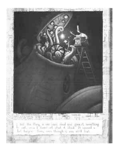
Figure 1. Feeding the lost thing

The narration in the corresponding book and movie segments dealing with feeding the lost thing in the back shed are displayed in Table 1.